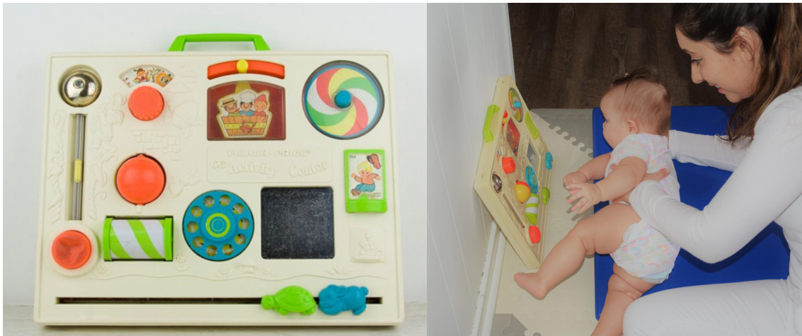
Cause and Effect Toys

Our favorite toys for holding and maintaining positions